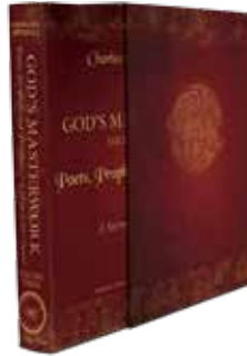
God's Masterwork, Volume Three: Poets, Prophets, and Promises— A Survey of Job–Daniel by Charles R. Swindoll CD series