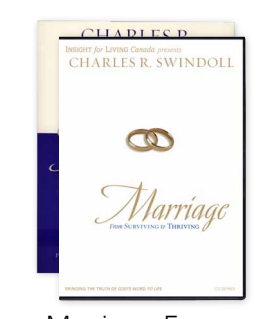
Marriage: From Surviving to Thriving by Charles R. Swindoll CD series of 8 CDs, workbook, and DVD