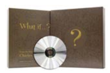
What If . . . ? by Charles R. Swindoll and Insight for Living Ministries Classic CD series