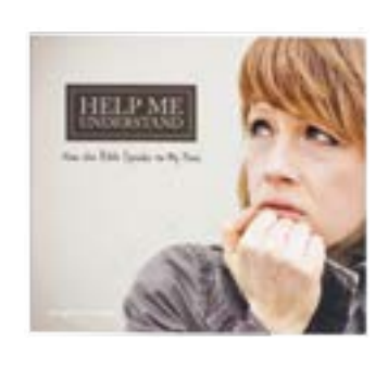
Help Me Understand: How the Bible Speaks to My Pain by Insight for Living Ministries Canada softcover book