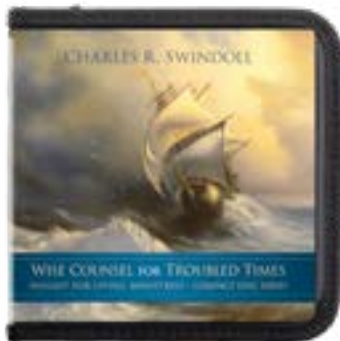
Wise Counsel for Troubled Times by Charles R. Swindoll CD series