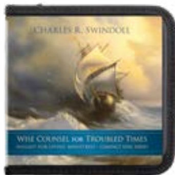
Wise Counsel for Troubled Times by Charles R. Swindoll CD series