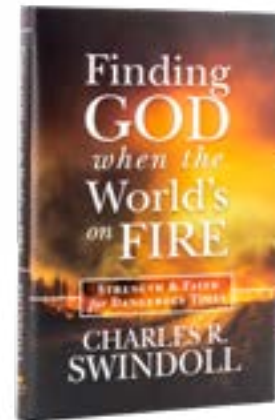
Finding GOD When the World's On FIRE by Charles R. Swindoll hardcover book

For these and related resources, visit www.insightworld.org/store or call USA 1-800-772-8888 • AUSTRALIA +61 3 9762 6613 • CANADA 1-800-663-7639 • UK +44 1306 640156