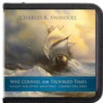
Wise Counsel for Troubled Times by Charles R. Swindoll CD series