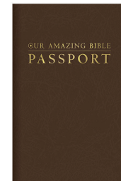
Our Amazing Bible Passport by Insight for Living Ministries softcover book

For these and related resources, visit www.insightworld.org/store or call USA 1-800-772-8888 • AUSTRALIA +61 3 9762 6613 • CANADA 1-800-663-7639 • UK +44 1306 640156