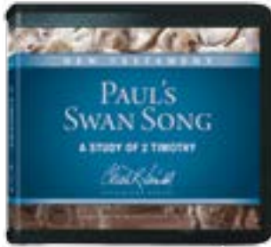
Paul's Swan Song: A Study of 2 Timothy by Charles R. Swindoll and Insight for Living Ministries CD series