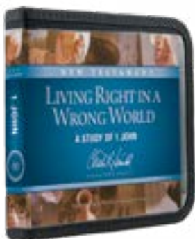
Living Right in a Wrong World by Charles R. Swindoll CD series