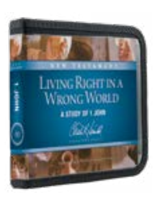
Living Right in a Wrong World by Charles R. Swindoll CD series