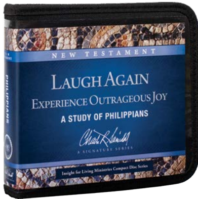
Laugh Again: Experience Outrageous Joy by Charles R. Swindoll CD series