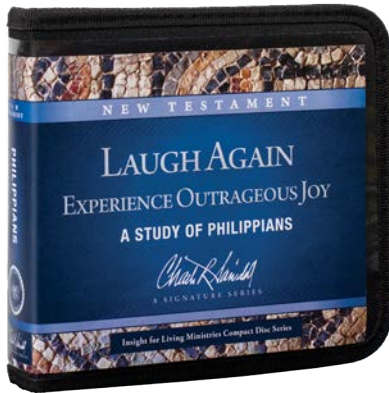
Laugh Again: Experience Outrageous Joy by Charles R. Swindoll CD series