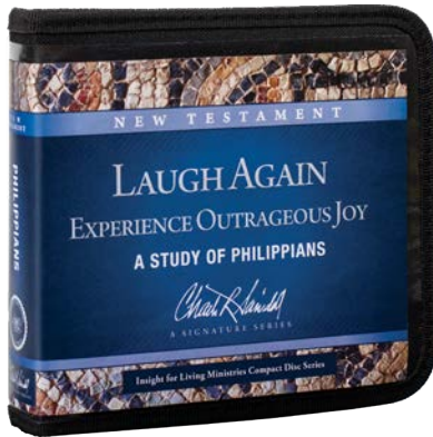
Laugh Again: Experience Outrageous Joy by Charles R. Swindoll CD series