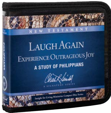
Laugh Again: Experience Outrageous Joy by Charles R. Swindoll CD series