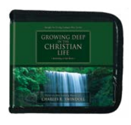
Growing Deep in the Christian Life by Charles R. Swindoll CD series

For these and related resources, visit www.insightworld.org/store or call USA 1-800-772-8888 • AUSTRALIA +61 3 9762 6613 • CANADA 1-800-663-7639 • UK +44 1306 640156