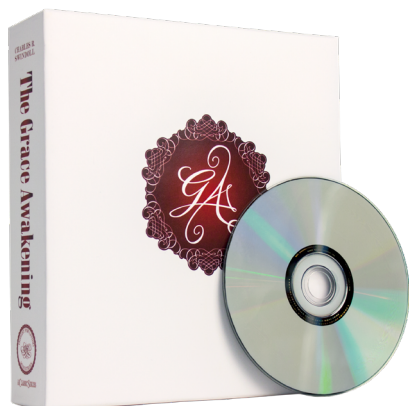
The Grace Awakening by Charles R. Swindoll CD series