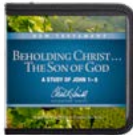
Beholding Christ . . . The Son of God: A Study of John 1–5 by Charles R. Swindoll CD series