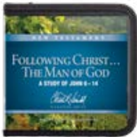
Following Christ . . . The Man of God: A Study of John 6–14 by Charles R. Swindoll CD series