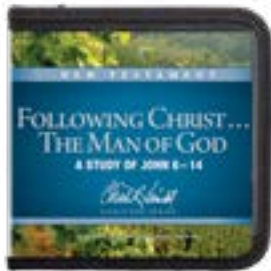
Following Christ . . . The Man of God: A Study of John 6–14 by Charles R. Swindoll CD series