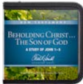
Beholding Christ . . . The Son of God: A Study of John 1–5 by Charles R. Swindoll CD series