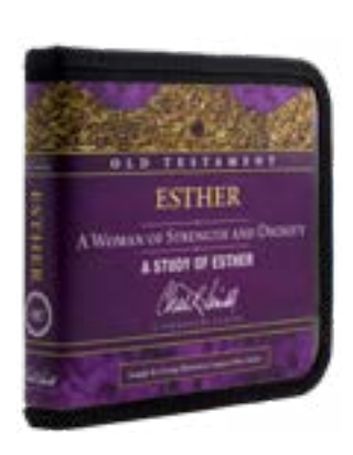
Esther: A Woman of Strength and Dignity by Charles R. Swindoll CD series