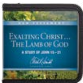
Exalting Christ . . . The Lamb of God: A Study of John 15–21 — A Signature Series by Charles R. Swindoll CD series