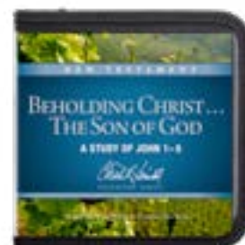
Beholding Christ . . . The Son of God: A Study of John 1–5 — A Signature Series by Charles R. Swindoll CD series

For these and related resources, visit www.insightworld.org/store or call USA 1-800-772-8888 • AUSTRALIA +61 3 9762 6613 • CANADA 1-800-663-7639 • UK +44 1306 640156