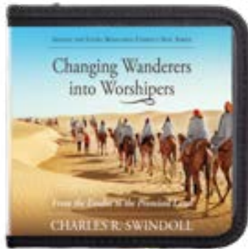
Changing Wanderers into Worshipers: From the Exodus to the Promised Land by Charles R. Swindoll CD series