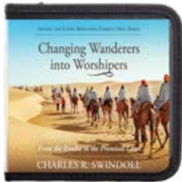
Changing Wanderers into Worshipers: From the Exodus to the Promised Land by Charles R. Swindoll CD series