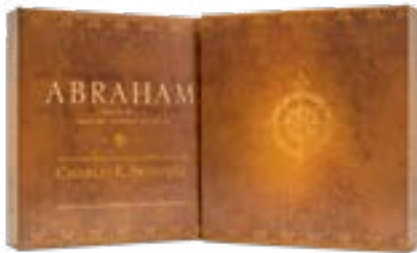
Abraham: One Nomad's Amazing Journey of Faith by Charles R. Swindoll Classic CD series