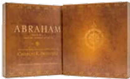
Abraham: One Nomad's Amazing Journey of Faith by Charles R. Swindoll Classic CD series