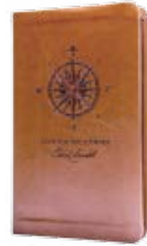
Faith for the Journey: Daily Meditations on Courageous Trust in God by Charles R. Swindoll LeatherLike book

For these and related resources, visit www.insightworld.org/store or call USA 1-800-772-8888 • AUSTRALIA +61 3 9762 6613 • CANADA 1-800-663-7639 • UK +44 1306 640156