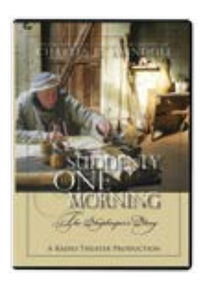
Suddenly One Morning (radio theater production) by Charles R. Swindoll

For these and related resources, visit www.insightworld.org/store or call USA 1-800-772-8888 • AUSTRALIA +61 3 9762 6613 • CANADA 1-800-663-7639 • UK +44 1306 640156