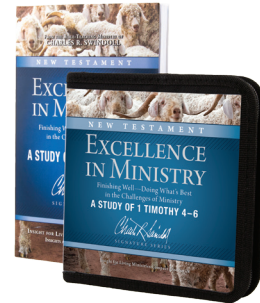
Excellence in Ministry: Finishing Well—Doing What's Best in the Challenges of Ministry by Charles R. Swindoll and Insight for Living Ministries CD series and softcover Bible Companion

For these and related resources, visit www.insightworld.org/store or call USA 1-800-772-8888 • AUSTRALIA +61 3 9762 6613 • CANADA 1-800-663-7639 • UK +44 1306 640156