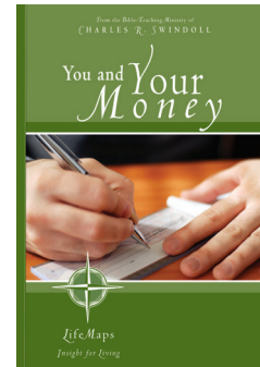
You and Your Money by Insight for Living Ministries softcover book

For these and related resources, visit www.insightworld.org/store or call USA 1-800-772-8888 • AUSTRALIA +61 3 9762 6613 • CANADA 1-800-663-7639 • UK +44 1306 640156