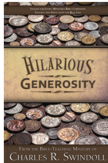
Hilarious Generosity Bible Companion by Insight for Living Ministries softcover Bible Companion