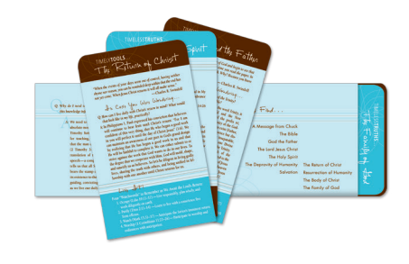
Essential Truths: A Pocket Guide for Growing Deep by Insight for Living Ministries 10 pocket-sized cards

To purchase related resources, please call CANADA 1-800-663-7639 or visit store.insightforliving.ca