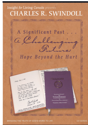
A Significant Past . . . A Challenging Future by Charles R. Swindoll compact disc set