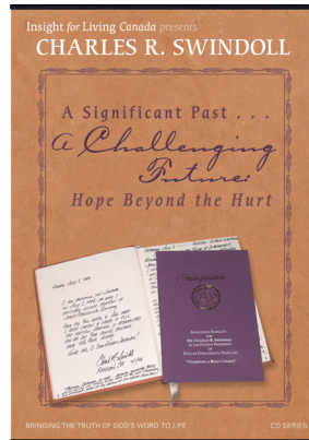
A Significant Past . . . A Challenging Future by Charles R. Swindoll compact disc set