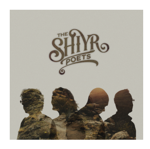
Songs for the Journey, Volume 1 The SHIYR Poets music CD