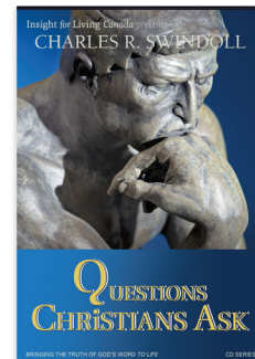
Questions Christians Ask by Charles R. Swindoll CD series