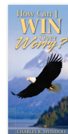
How Can I Win Over Worry? by Charles R. Swindoll booklet