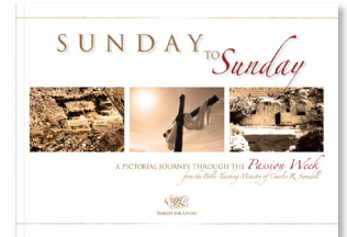
Sunday to Sunday: A Pictorial Journey Through the Passion Week by Insight for Living Ministries softcover book