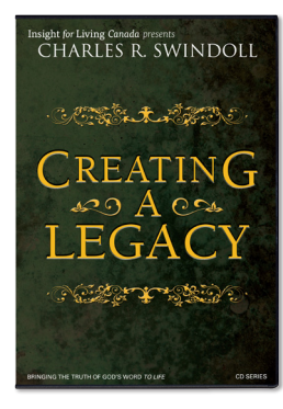
Creating a Legacy by Charles R. Swindoll message series