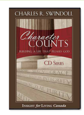
Character Counts: Building a Life That Pleases God by Charles R. Swindoll CD series