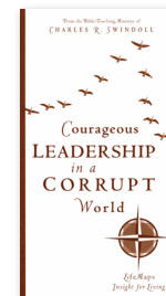
Courageous Leadership in a Corrupt World by Charles R. Swindoll softcover book

To order any of these recommended resources, call 1-800-663-7639 or visit insightforliving.ca