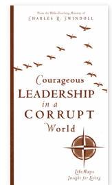
Courageous Leadership in a Corrupt World by Charles R. Swindoll softcover book

To order any of these recommended resources, call 1-800-663-7639