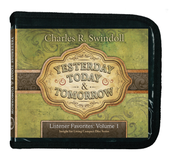
Listener Favorites, Volume 1: Yesterday, Today, and Tomorrow by Charles R. Swindoll CD series