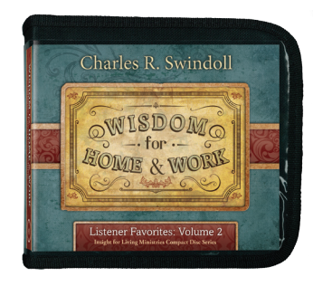
Listener Favorites, Volume 2: Wisdom for Home and Work by Charles R. Swindoll CD series

For these and related resources, visit www.insightworld.org/store or call USA 1-800-772-8888 • AUSTRALIA +61 3 9762 6613 • CANADA 1-800-663-7639 • UK +44 1306 640156