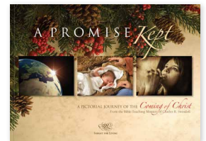
A Promise Kept: A Pictorial Journey of the Coming of Christ by Insight for Living softcover book

To order any of these recommended resources, call 1-800-663-7639 or visit insightforliving.ca