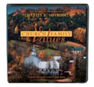
Church Family Values by Charles R. Swindoll CD series