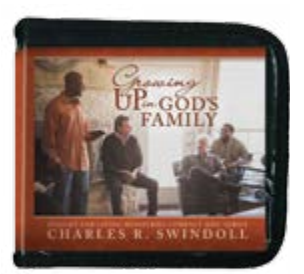
Growing Up in God's Family by Charles R. Swindoll CD series