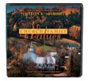
Church Family Values by Charles R. Swindoll CD series