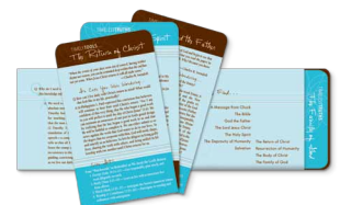
Essential Truths: A Pocket Guide for Growing Deep by Insight for Living card set

To order any of these recommended resources, call 1-800-663-7639 or visit insightforliving.ca