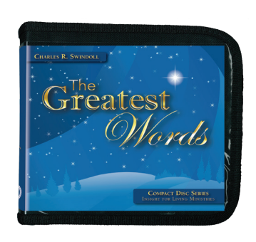
The Greatest Words by Charles R. Swindoll CD series