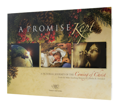
A Promise Kept: A Pictorial Journey of the Coming of Christ by Insight for Living Ministries softcover book