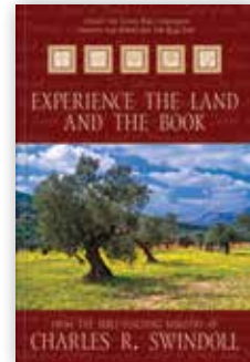
Experience the Land and the Book by Insight for Living Ministries softcover Bible Companion

For these and related resources, visit www.insightworld.org/store or call USA 1-800-772-8888 • AUSTRALIA +61 3 9762 6613 • CANADA 1-800-663-7639 • UK +44 1306 640156