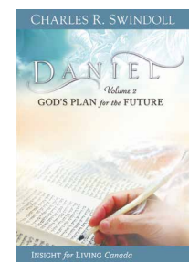
Daniel, Volume 2: God's Plan for the Future Bible Companion by Insight for Living softcover book